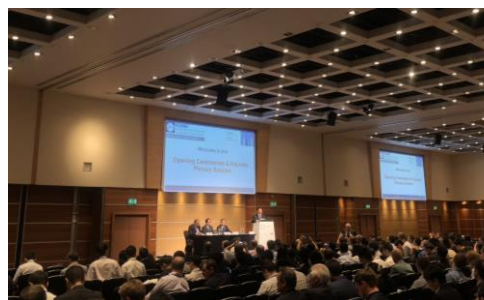
Photo 1 Opening ceremony & keynote plenary session at Cemant Hall

The ICONE-26 covered wide range of topics comprised of following tracks: (1) Operations & Maintenance, Engineering, Modifications, Life extension, Life Cycle and Balance of Plant; (2) Nuclear Fuel and Material, Reactor Physics and Transport Theory; (3) Plant Systems, Structures, Components and Materials; (4) Instrumentation and Control (I&C) and Influence of Human Factors; (5) Advanced Reactors and Fusion Technologies; (6) Nuclear Safety, Security, and Cyber Security; (7)