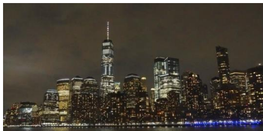
Photo 2: A view of Manhattan Skyline and the World Trade Center from a cruise boat

On Day 2, twelve presentations were made in three sessions: Boiling, Mini & Microchannels, Drag Reduction & Elongated Bubbles. In the evening, nearly all the participants and their spouses joined an excursion on a City Harbor Lights Cruise boat in which Manhattan's illuminated skyline (photo 1) as well as the Statue of Liberty could be viewed.