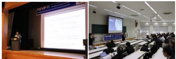
Photo 1 Keynote Lectures

The objective of this symposium is to provide an opportunity for world-wide researches and engineers in all areas of flow visualization, image processing and related techniques to exchange knowledge and new experience in the spirit of collaboration and friendship. Papers dealing with current research ranging from fundamental principles and techniques to applications on the above topics are appropriate. Topics include, but are not limited to, flow field visualization, surface flow visualization, computer