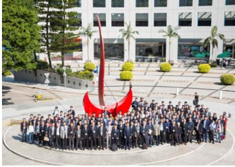
Figure 1 Group Photo