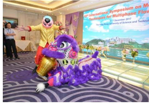
Figure 2 Lion Dance in the Banquet

ISMTMF focused on the advanced measurement techniques and extended to complex multiphase flow systems. It covers wide subjects from basic science to industry aiming at new findings of multiphase fluid dynamics as well as responding to requirements in multiphase industries. The first ISMTMF was inaugurated in Nanjing, China, in 1995. The forum has been held every two to three years, including those in Beijing (1998), Fukui (2001), Hangzhou (2004), Macau (2006), Okinawa (2008), Tianjin (2011), Guangzhou (2013) and Sapporo (2015). Together, these events have helped promote scientific and technical communications well as foster collaboration.